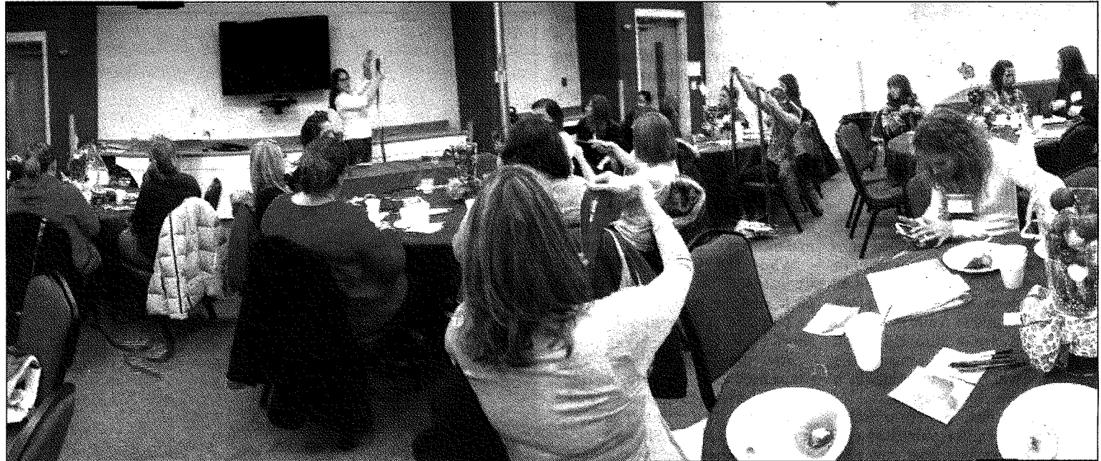
A speaker from The Container Store shows RECHARGE moms how to make a perfect gift bow.